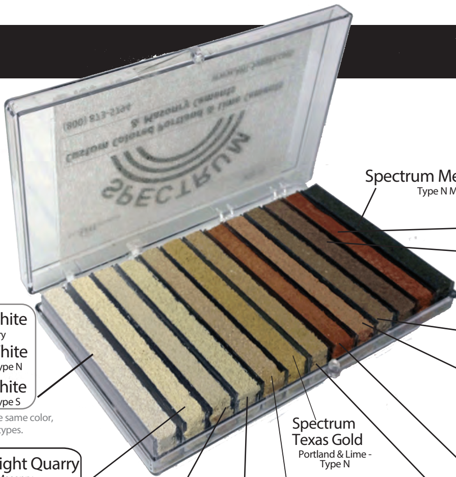
Spectrum Medium Black Type N Masonry