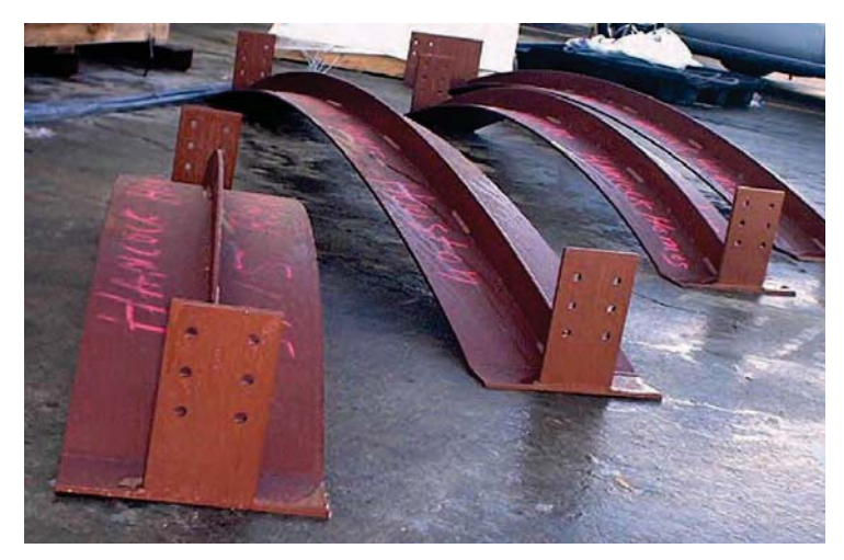
Heavy-duty arched plates suitable for high-stength fastening-to-framing corrosion-resistant metal primer coating.