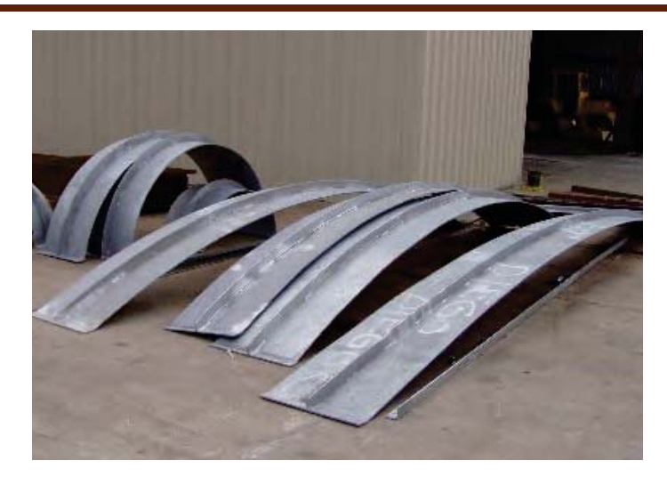
Standard duty arched plates Hot-dipped galvanized.