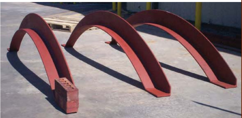
Arched lintels. (6" x 4" x 3/8" shown.)