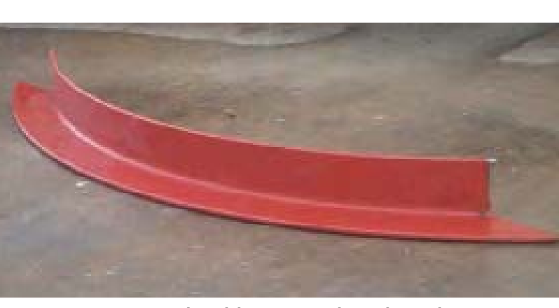
Standard bay window lintel