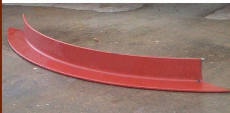
Standard bay window lintel