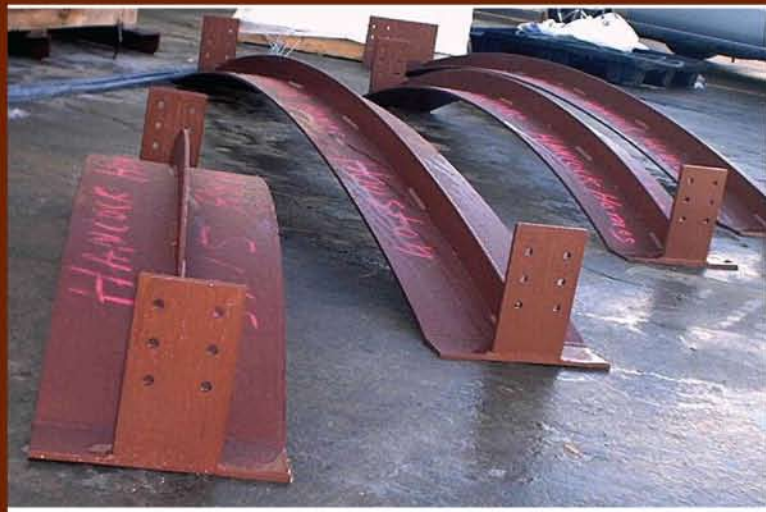
Heavy-duty arched plates suitable for high-strength fastening-to-framing corrosion-resistant metal primer coating.