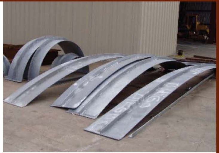
Standard duty arched plates Hot-dipped galvanized.