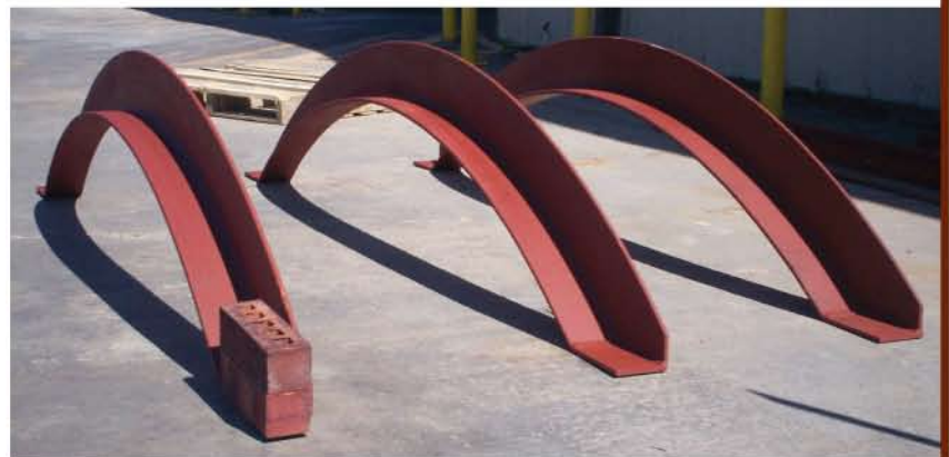
Arched lintels. (6" x 4" x 3/8" shown.)