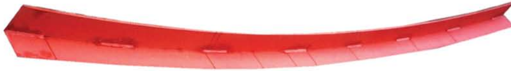
Ski slope arched lintel (These are typically bolted to framing to support masonry over framed areas.)