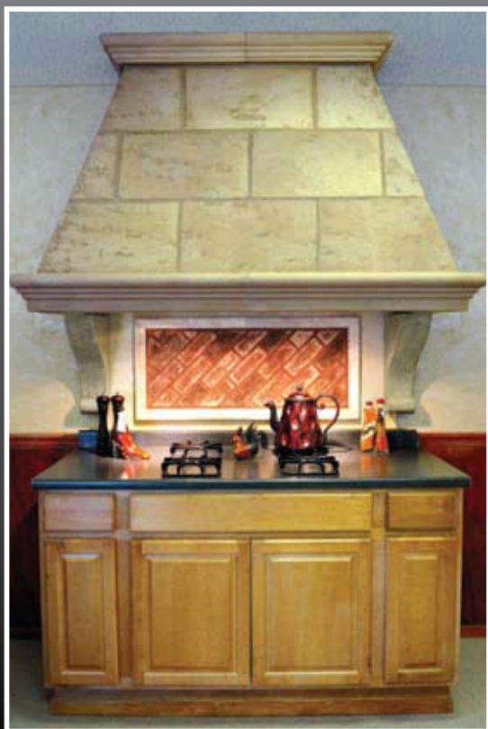
Oven vent hood with Tuscan texture.